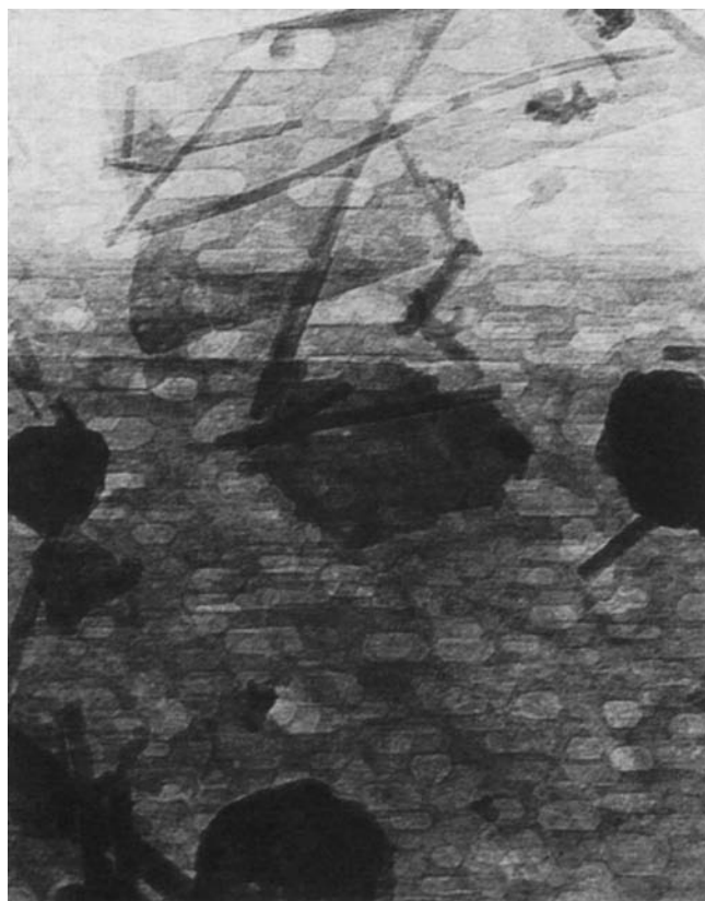
Fig. 1 Transmission electron micrograph of OMS-1, 380 000 \times

shown in Fig. 2. Loss of the tunnel structure above 500 ^{\circ}\text{C} was confirmed by X-ray diffraction (XRD) and Brunauer–Emmett–Teller (BET) measurements. Negligible sorption of 1,3,5-triethylbenzene (8.4 \text{\AA} ) or hexachlorocyclopentadiene (7.5 \text{\AA} ) was observed for materials activated at all temperatures. The equilibrium uptake of \text{CCl}_4 , which has a kinetic diameter of 6.9 \text{\AA} , of about 18 g per g of OMS-1 is similar to that for cyclo- \text{C}_6\text{H}_{12} . Notably the layered birnessite precursor sorbs all of these molecules (as expected), although uptake curves for cyclohexane show considerably different rates and amounts of uptake than for OMS-1. 8